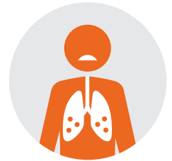
Severe illness (sickness)