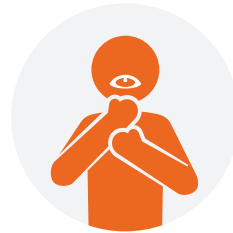
Shortness of breath or difficulty breathing